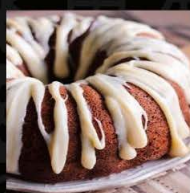
SWEET POTATO BUNDT CAKE