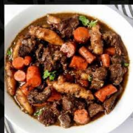
JOLLOF RICE & CHICKEN