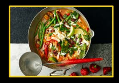
Caribbean Vegetable Curry