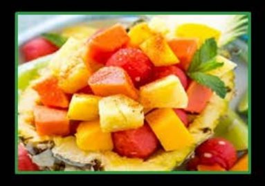
Mango Fruit Cocktail