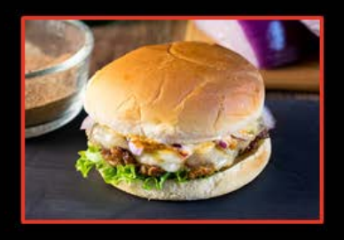
Jerk Pork Burger