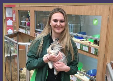
Summa Goodrum Pets at Home