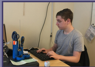
George Osborne Value Cars Basildon