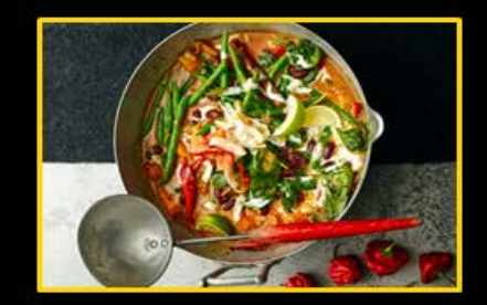
Caribbean Vegetable Curry