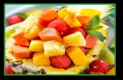
Mango Fruit Cocktail