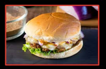
Jerk Pork Burger