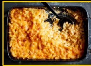
Southern Style Mac & Cheese