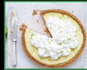
Key Lime Pie