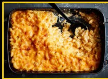
Southern Style Mac & Cheese