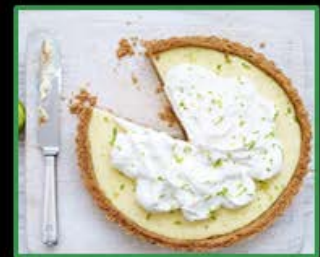
Key Lime Pie