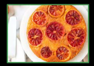
Orange Cornmeal Cake & Cream