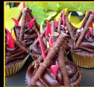
Bonfire Cupcakes 50p each