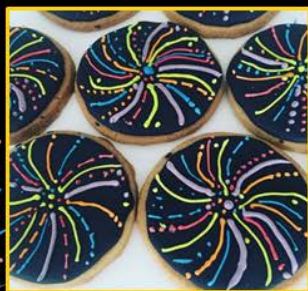
Catherine Wheel Cookies 50p each

To celebrate Guy Fawkes Night the Dining Hall will be serving fireworks themed food at break & lunchtime on Friday 4 th November