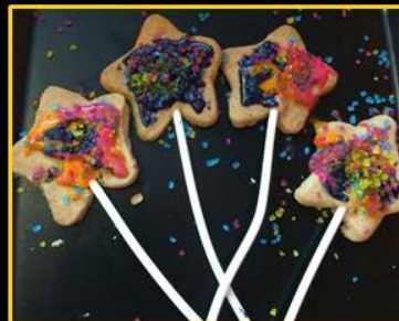
Firework Cookie Pops 50p each