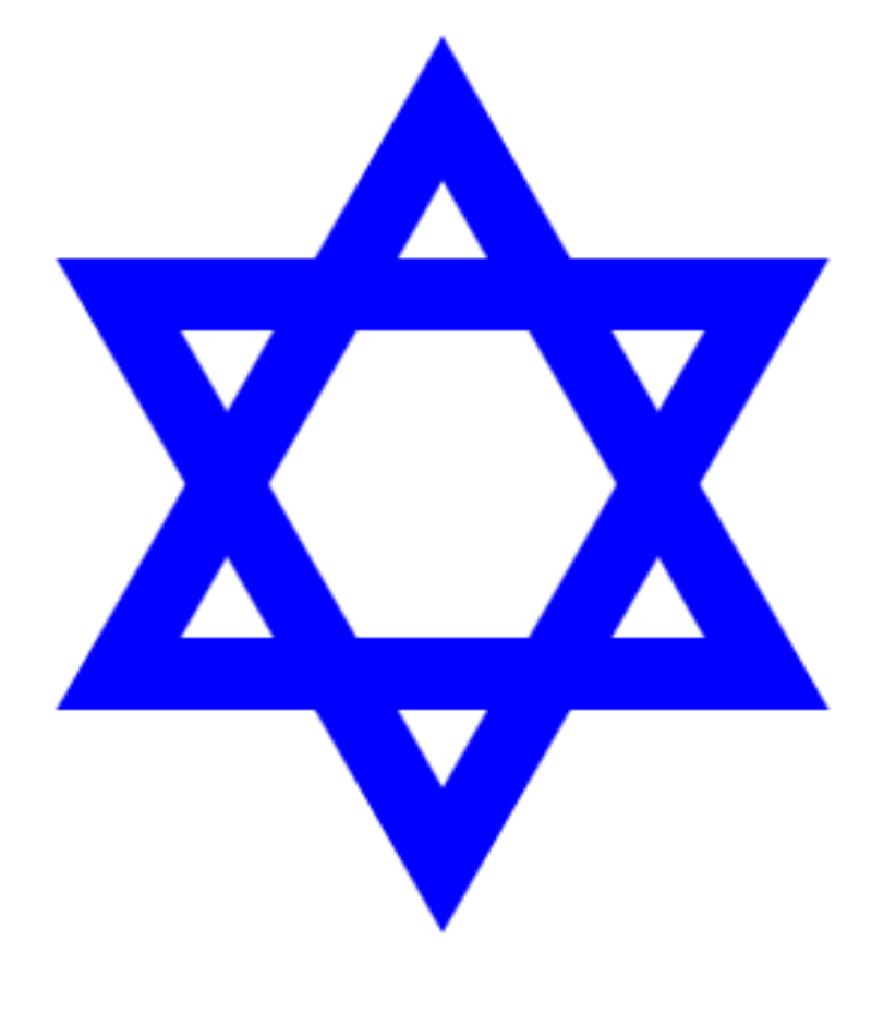
Star of David